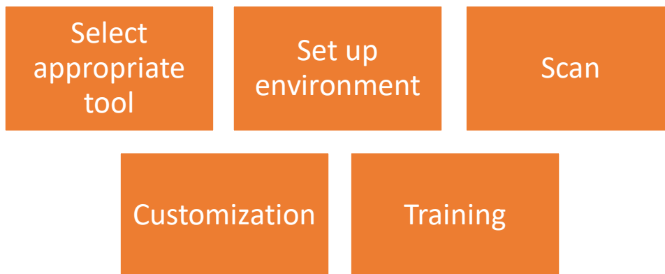
Figure 1 Stages of implementation process of SAST.

Following are the stages of the implementation process of the SAST technique: -