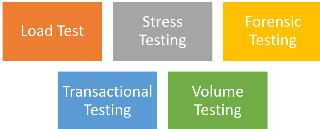
Figure 1 Types of Conformance Testing.