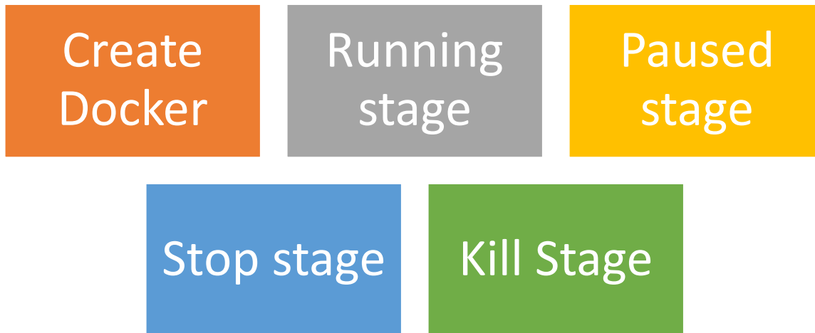
Figure 2 Implementation/Life cycle of Docker